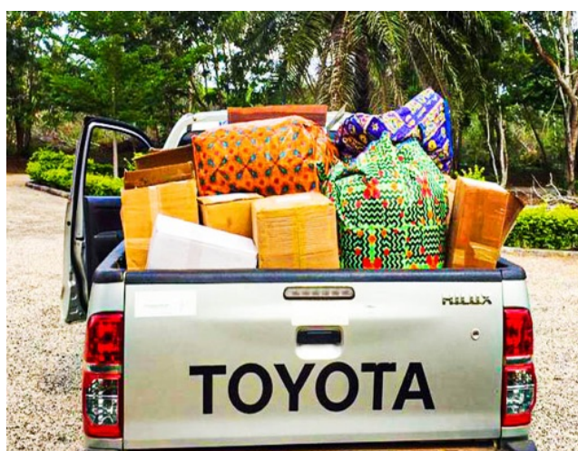
Donations in-kind arriving at PPRC