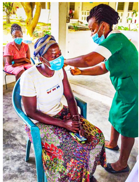
Vaccinations in St. Clare's