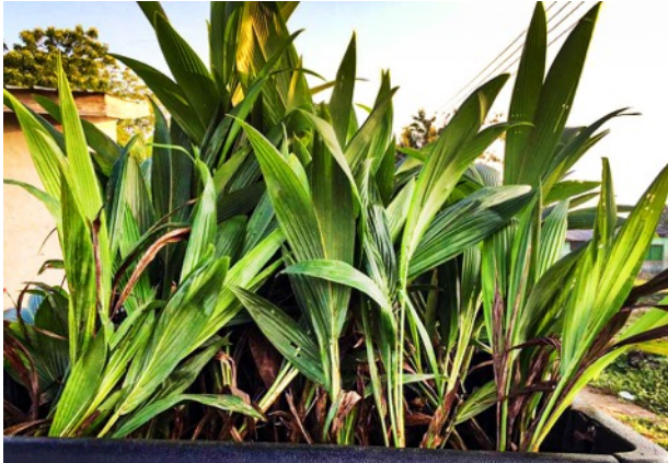
Coconut Seedlings arriving for planting