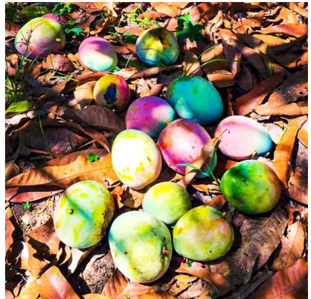
Mangoes grown on our farm