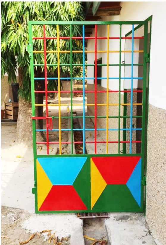
St. Elizabeth's freshly re-painted gate