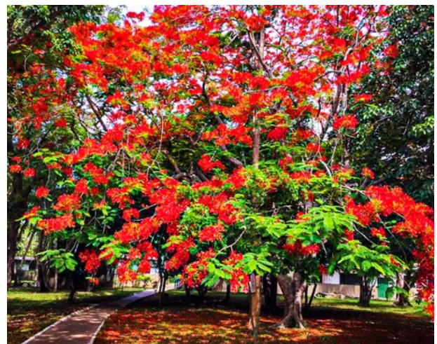
Flame Tree in bloom in Ahotokurom