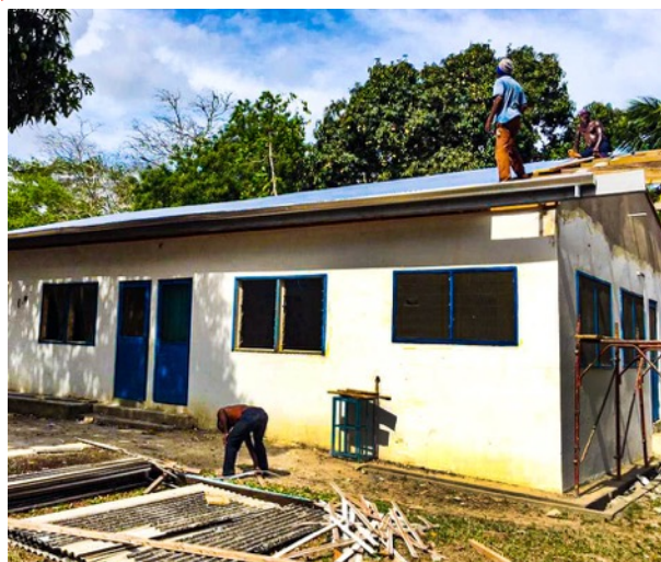
Re-roofing – work-in-progress