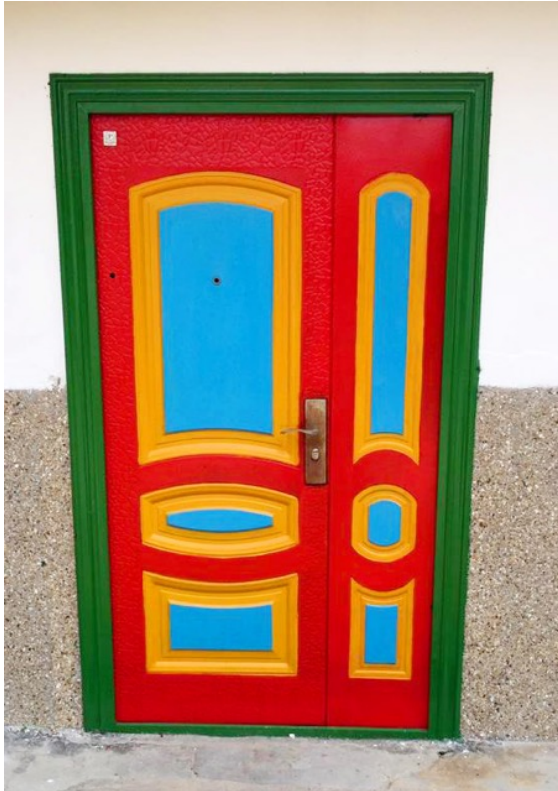
St. Elizabeth's freshly re-painted door