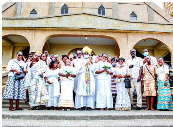
After the ceremony - with the Archbishop – outside Moree Church