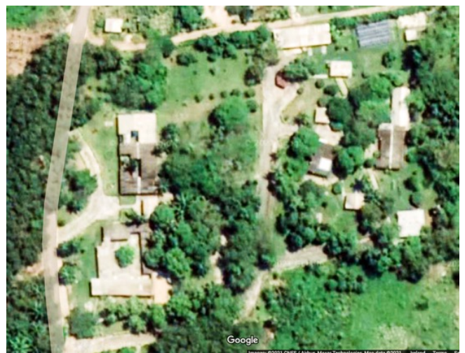
Aerial view of Ahoto main compound