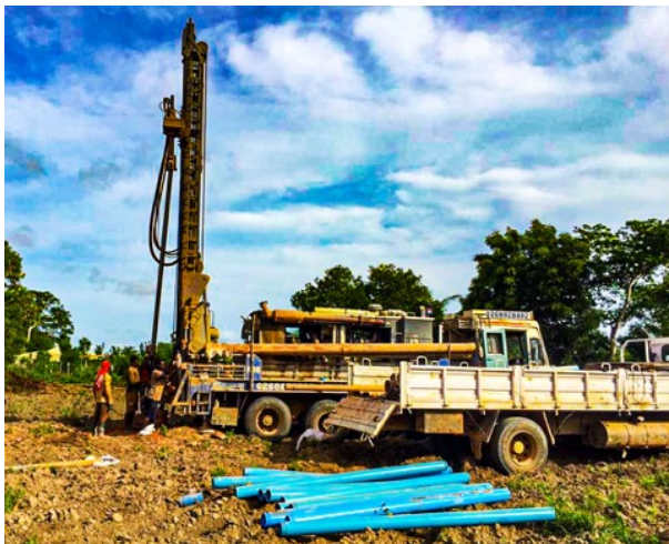
Drilling the borehole