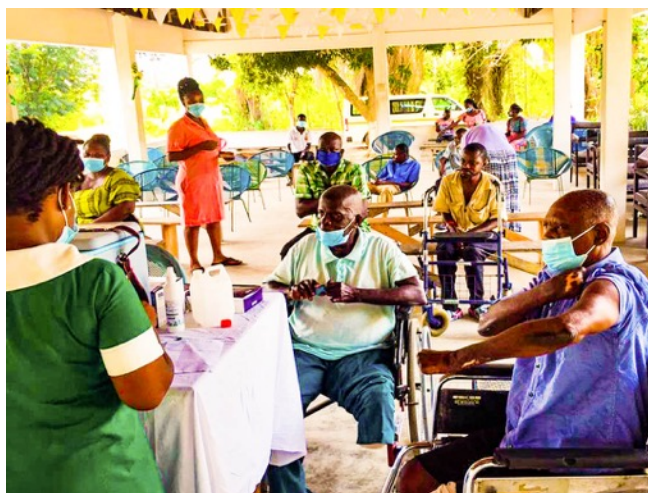
Vaccination Centre in the Pavilion