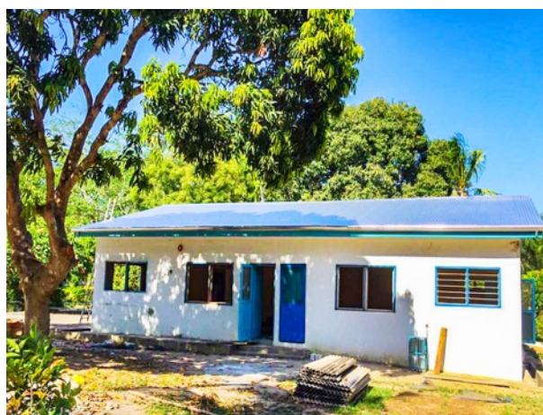
New roof installed