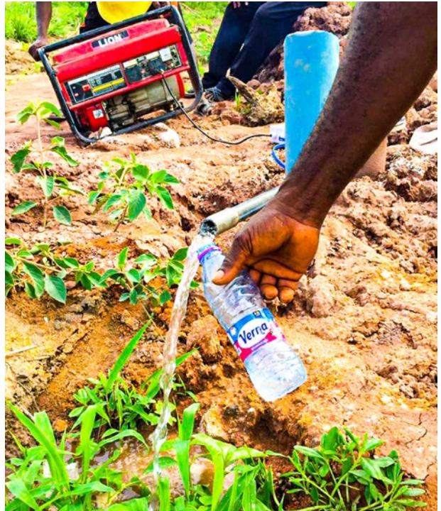
Sampling the new borehole water