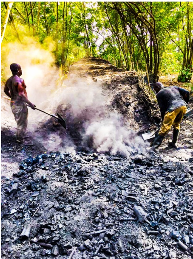
Charcoal production in Ahoto