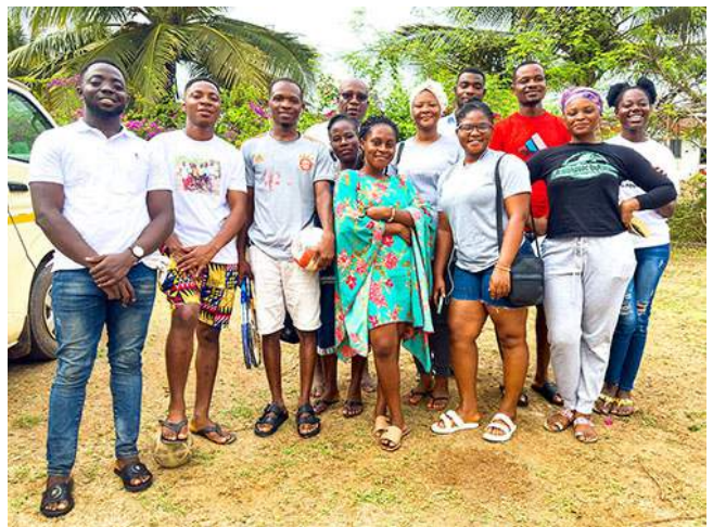
Interns & National Service (NS) Staff

A sod-cutting ceremony marked the beginning of an income-generating project with store rental and accommodation. The primary objective is to assist PPRC in generating income to work towards long-term independence from donor funding. The project will also help stop the encroachment of land at Enyinndakurom. We have £20,000 from the Hayward Legacy, and we need to secure special funding through a capital budget proposal to undertake this project.