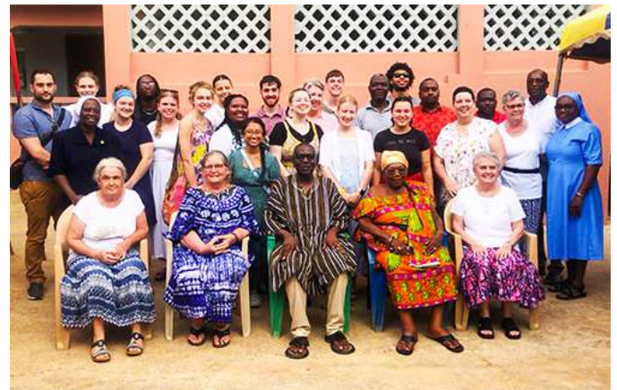
Service-Learning - USA Visitors

We welcomed 22 USA students and faculty members in June. The purpose of their visit was to provide them with international service-learning and authentic cultural immersion experiences by interacting with staff and clients at PPRC.