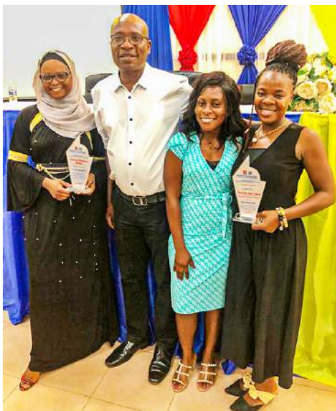
UCC Mental Health Award