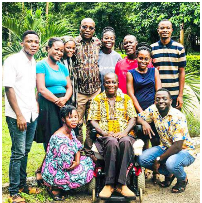
Greetings from the PPRC Team