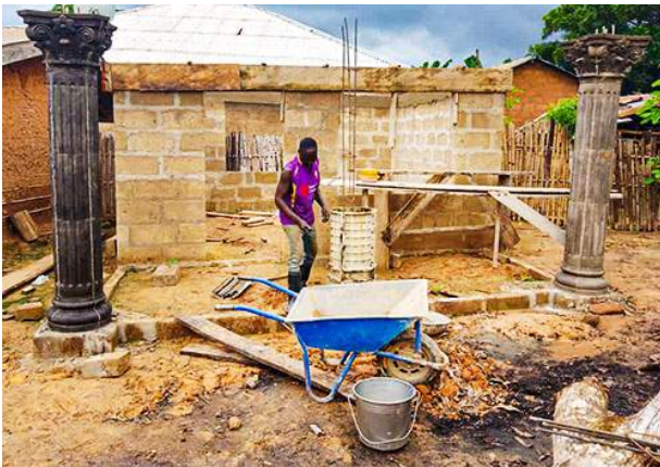
Work in Progress - Kojo's Family Home