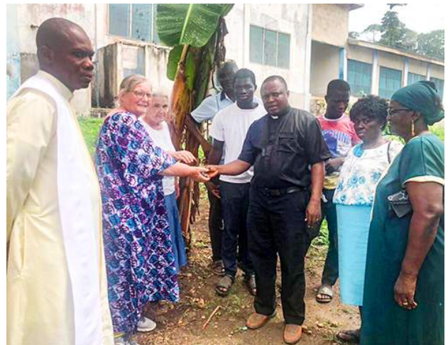
Twins' New House – Handover Ceremony

PPRC staff have been doing house-to-house visits with the families in Enyinndakurom. The team believes this