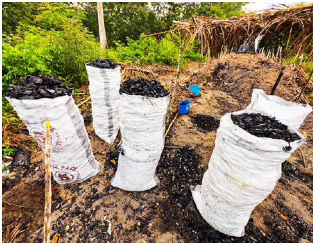
Charcoal – Ready for Sale

strong. We have generated >79,000 units (KWh), and our electricity costs are down >90%.