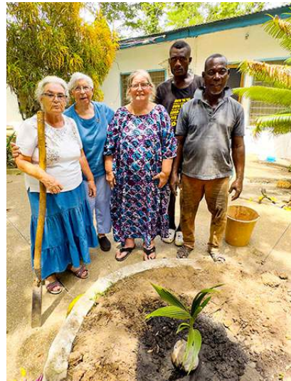
DMJ Sisters Planting Coconut Tree

lives over the years, and we are confident that the benefits of their efforts will continue to yield good results. We will work hard to maintain the DMJ charism and continue caring for the people 'for whom society says there is no place'. We are sorry to see them go and wish them well in their future ministries.