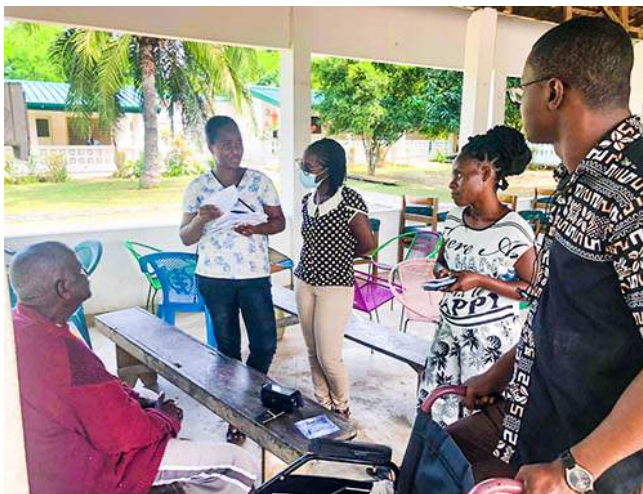
EPC Visit to St. Clare’s