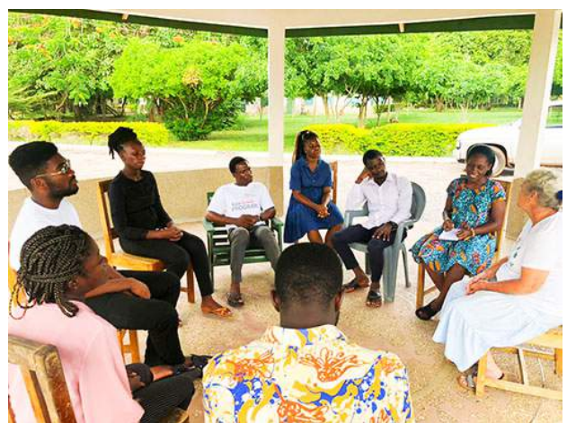
New Winneba Students – Introductions