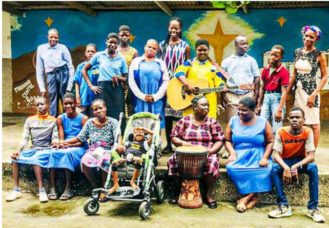
Greetings from St. Elizabeth's

We are seeking financial support to start this project; a medium-sized baking oven and related equipment are among the essential items required.