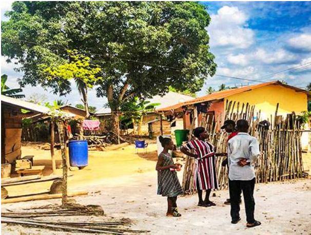
Visit to Kojo's Village