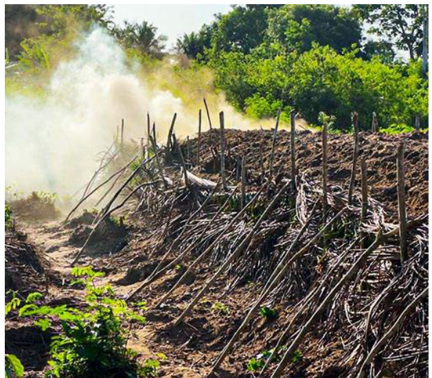
Charcoal Pile Smoldering

We recently took measures to reduce the use of plastic bags throughout the campus. Our access roads are deplorable due to the recent heavy rains and have become mostly pools and potholes. We urgently need to do something about this.