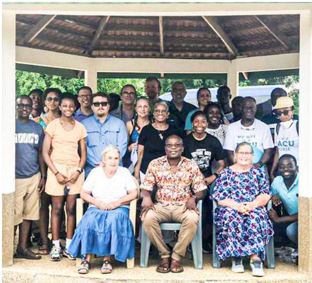
Episcopal Diocese of Atlanta Visit