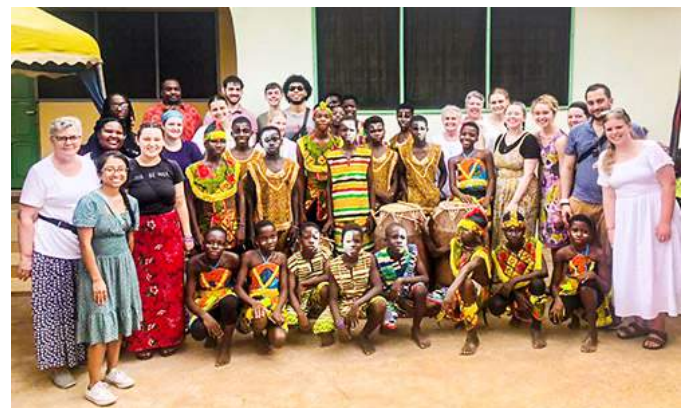
Cultural Immersion - USA Visitors