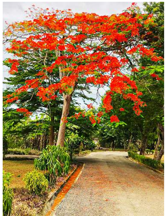
Fire Tree in Bloom, Ahotokurom

2023, it was 37.7%. Ghana is restructuring its debt as a condition for receiving an IMF bailout. The Ghana Cedi has fallen by ~50% against major currencies, and the price of motor fuel has trebled in the past 18 months. The only good news is that foreign donations now go further than before. Any contributions or fundraising would be greatly appreciated.