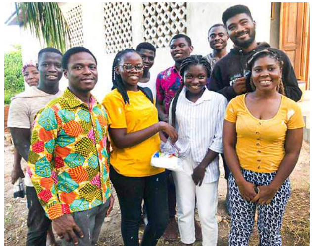
New Winneba Students