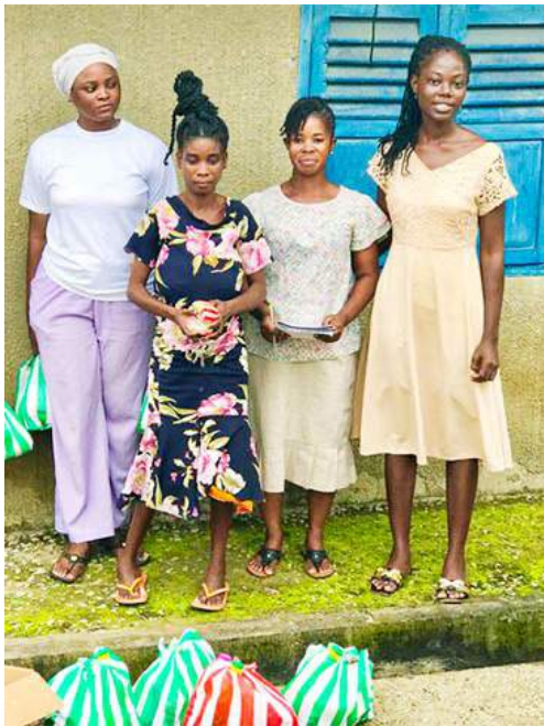
Enyinnda Outreach Visit

Our five current NS employees recently graduated from their degree courses at Winneba University. This was a proud day for everyone. They've been taking on lots of responsibilities and producing great results. We are so blessed to have these young people with us, and we'd have struggled recently without their help.