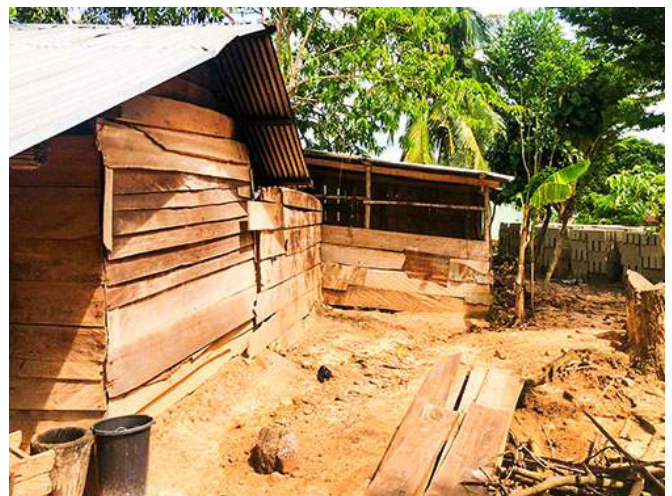
Kojo’s Home / Village

We are supporting 26 clients through our outreach services: 19 children directly and seven older adults living independently. Our top priority clients are leprosy-related families, vulnerable families trying to stay together, and disadvantaged single-parent families. We strive to achieve the best possible outcome for each client within the constraints of our available resources. The critical difference between our outreach services and our former residential approach is that now, our