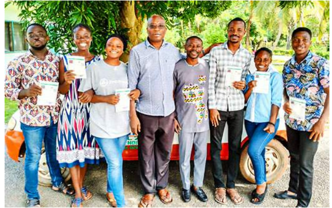
PPRC Staff – New Driving Licences

Recently, six PPRC staff members passed their driving test and were given their driving licences.