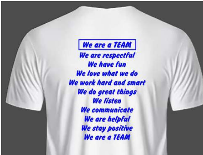
PPRC Staff T-Shirt