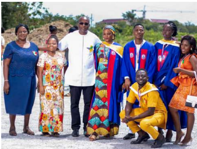
Graduation Day Winneba