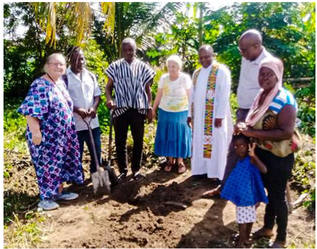
Sod Cutting Ceremony, Enyinnda

A sod-cutting ceremony marked the beginning of an income-generating project with store rental and accommodation. The primary objective is to assist PPRC in generating income to work towards long-term independence from donor funding. The project will also help stop the encroachment of land at Enyinndakurom. We have £20,000 from the Hayward Legacy, and we need to secure special funding through a capital budget proposal to undertake this project.