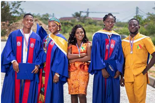
Five NS/PPRC Winneba Graduates

We welcomed 22 USA students and faculty members in June. The purpose of their visit was to provide them with international service-learning and authentic cultural immersion experiences by interacting with staff and clients at PPRC.