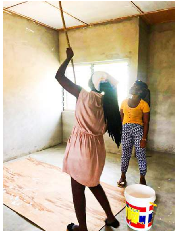
Student Volunteers Painting Twins' House