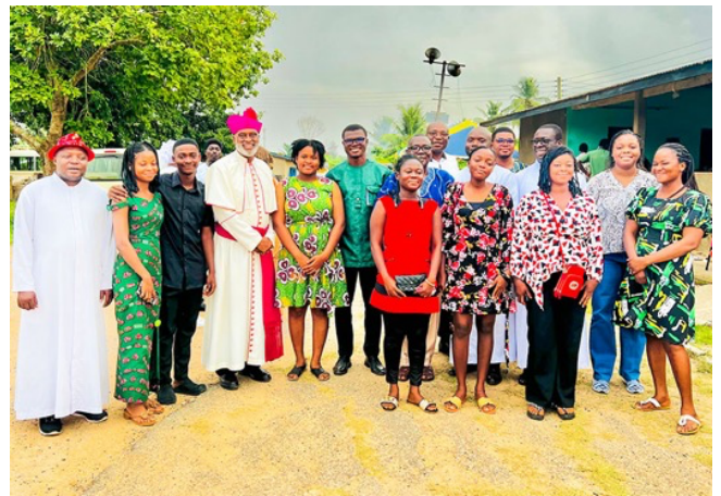
The Archbishop visiting Enyinnda

Our core mission in Enyinndakurom is to provide consistent, high-quality community care and rehabilitation for leprosy survivors who are socially and economically vulnerable.