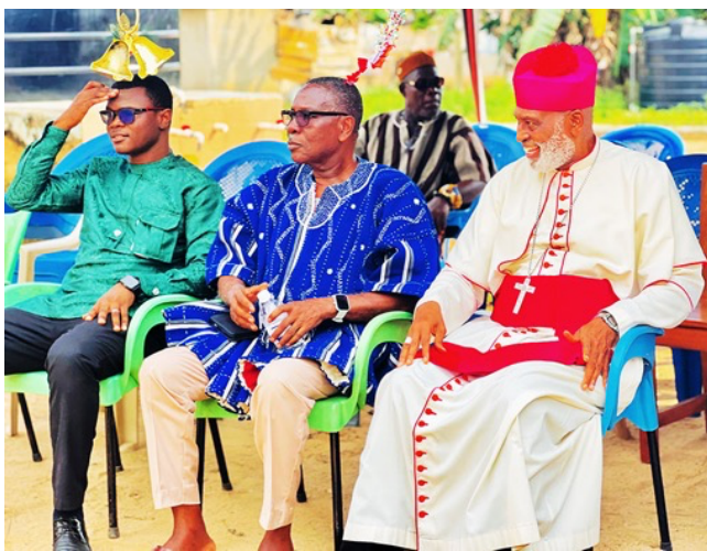
The Archbishop with board members