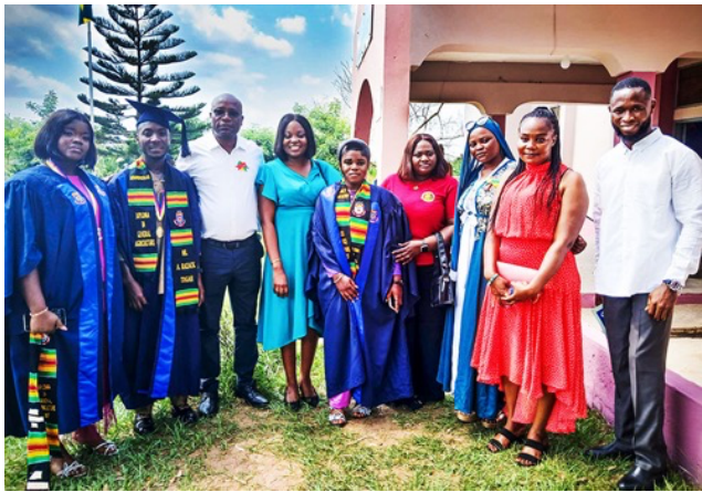
Kwadaso Agriculture College Graduation