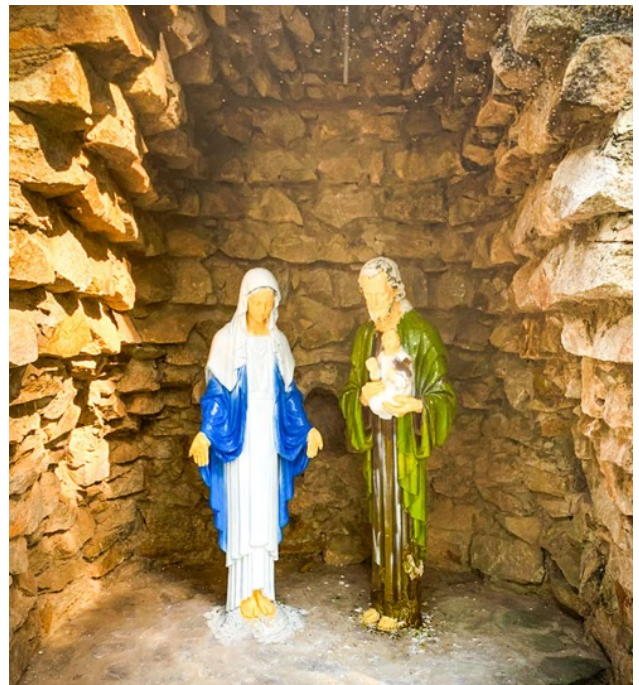
Ahoto Grotto- after painting