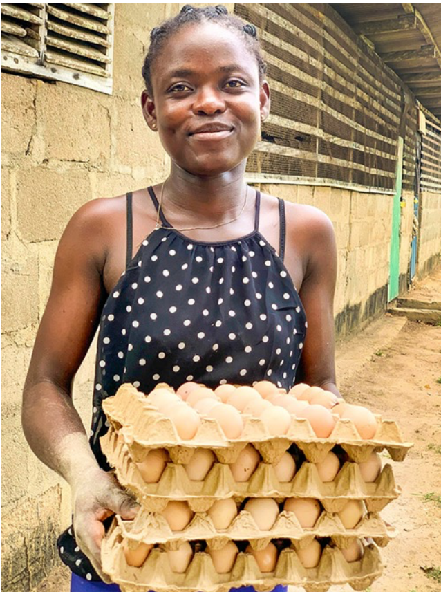
Eggs from our Farm

The vegetable farm successfully completed its first production cycle, cultivating crops such as carrots, cabbage, lettuce, cucumber, and green peppers. This milestone provides valuable insights to improve future planting, harvesting, and marketing. Our pineapple fields remain in good condition, with healthy growth observed and strong yields anticipated.