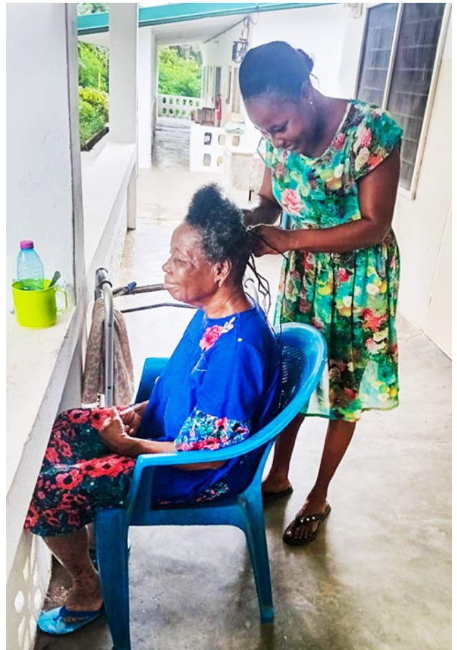
Hairdressing in St Clare's