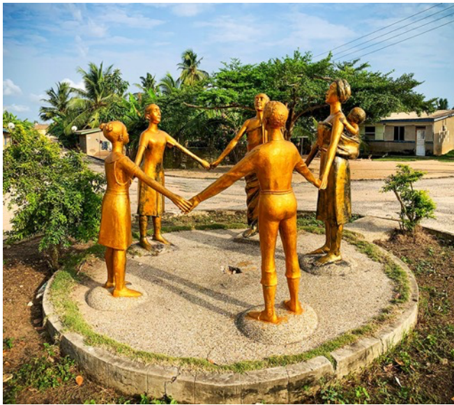
Enyinnda Statues – after painting

The event was well attended by parents, who shared encouraging feedback on their children’s progress. Since the start of 2026, we have introduced regular sensory and water therapy sessions for six children, held three times weekly, with early improvements seen in attention and focus.