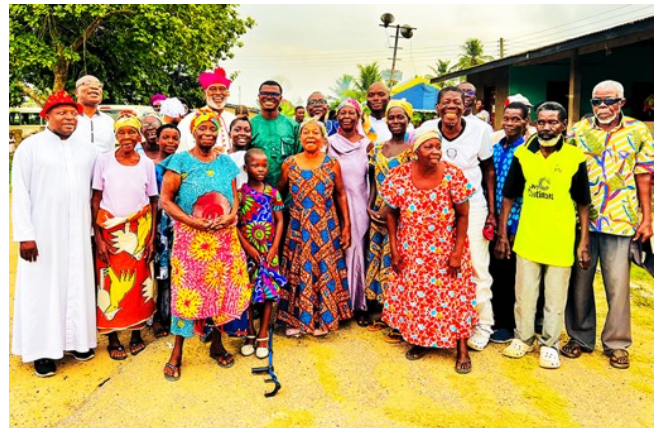
The Archbishop with Enyinnda residents