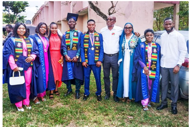
Kwadaso Agriculture College Graduation