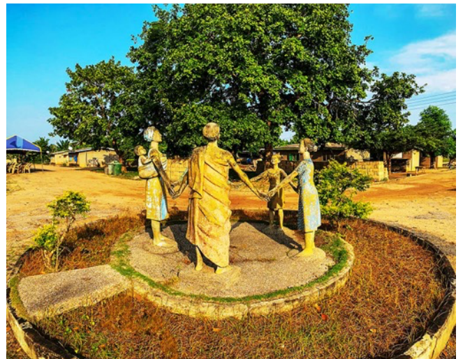
Enyinnda Statues – before painting