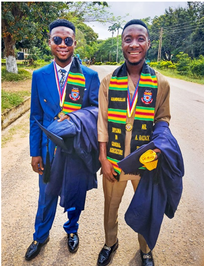
National Service Personnel from Kumasi