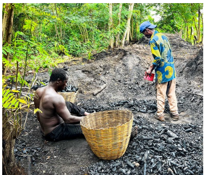
Sorting the Charcoal