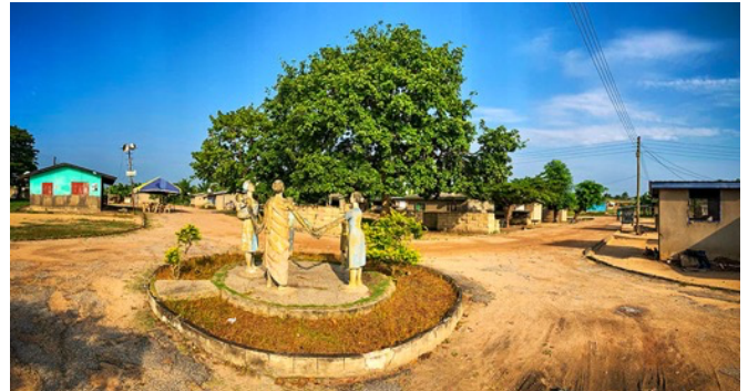
Enyinnda Statues – before painting

We also took the opportunity to do some painting before our visitors arrived.