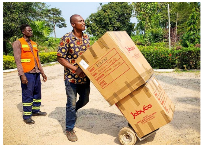
Friends of Ahoto UK Supplies Arriving