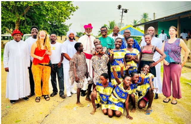
The Archbishop with the dancers

We also took the opportunity to do some painting before our visitors arrived.