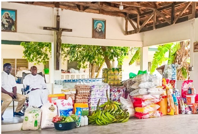
St Francis de Sales Donation