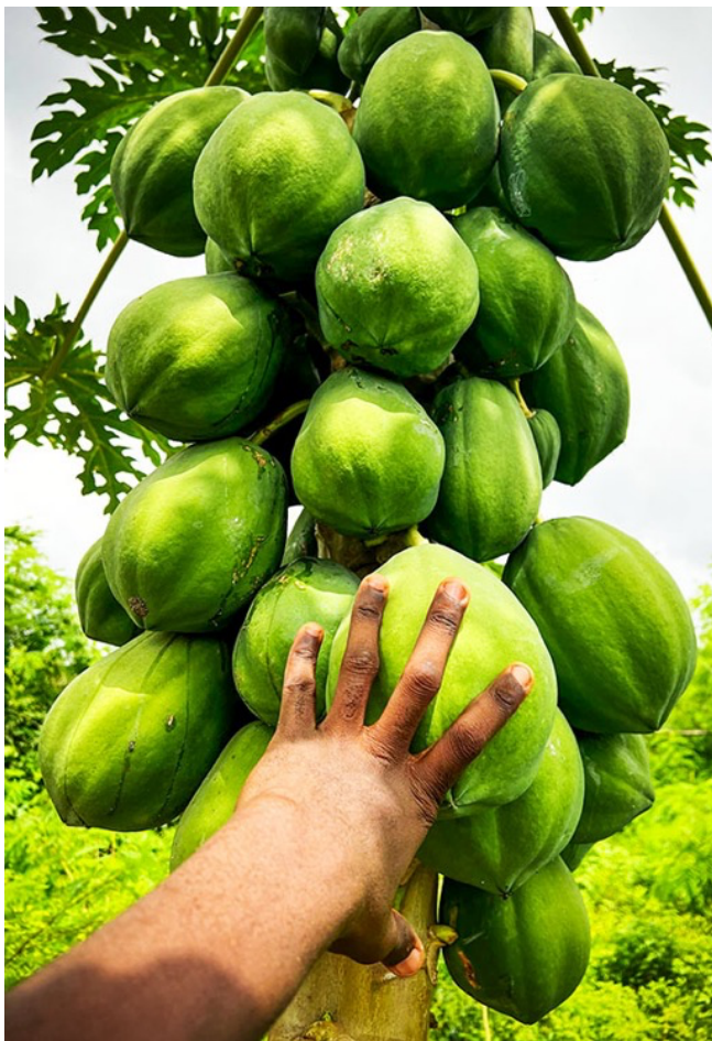
Paw paw fruit