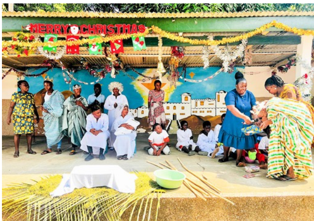
St. Elizabeths Nativity Play