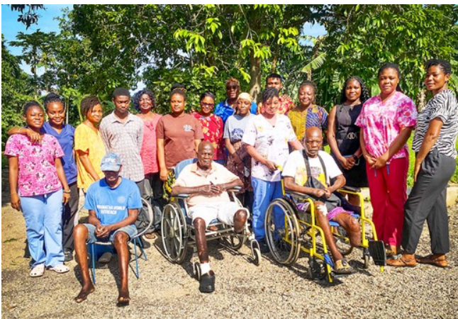
UEW Lecturer, interns and residents