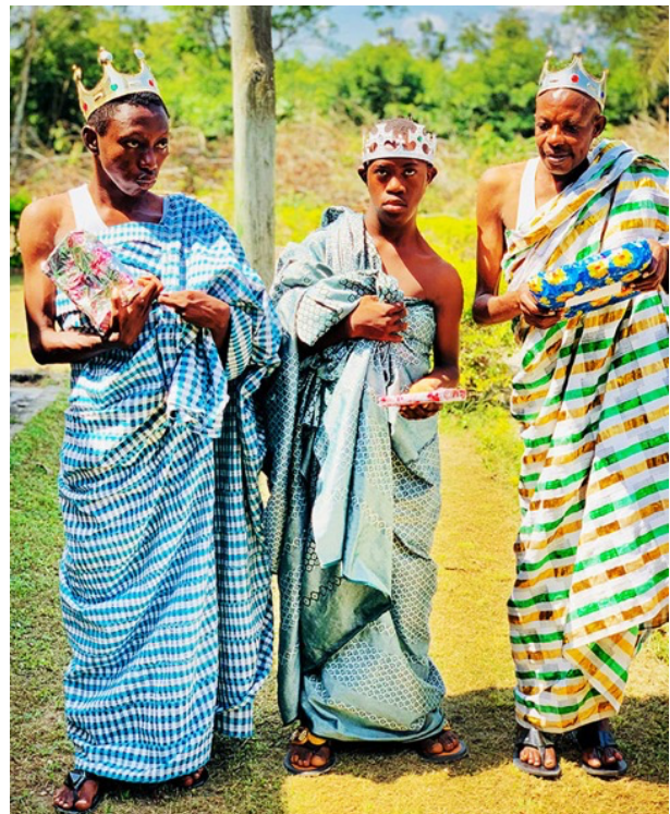
The Three Kings – St. Elizabeth's