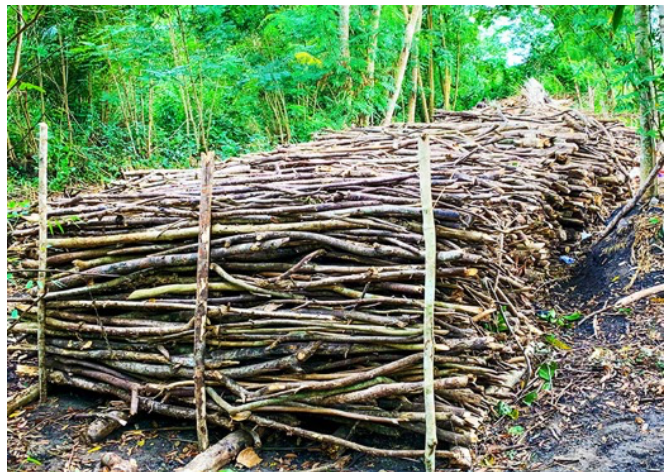
Preparing the Charcoal Pyre