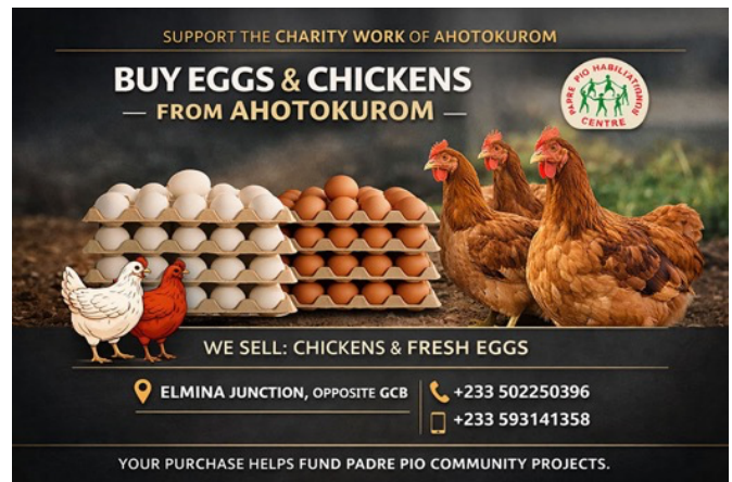
Advert for PPRC Eggs

As part of our diversification strategy, a pig farm has been established. Initial stock has been introduced, and crossbreeding is underway to enhance genetic quality and productivity. We recently managed to buy two strimmer's for grounds maintenance, but we would be happy to get two more, as they don't last long in this harsh environment.