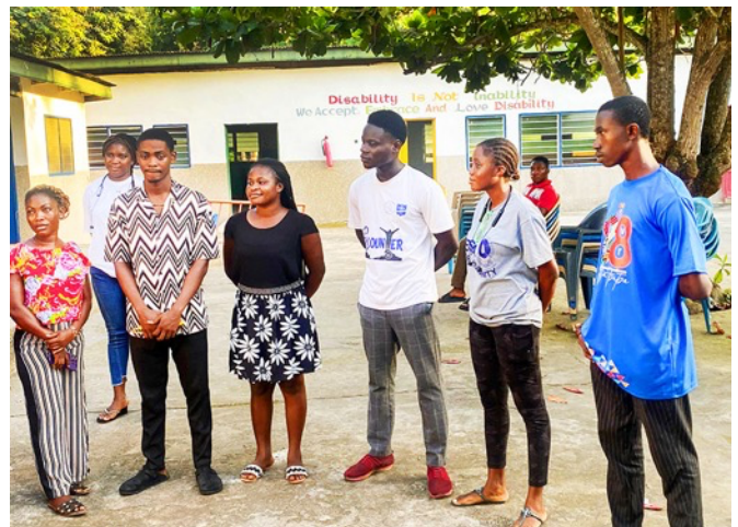
Interns, NSS and Staff