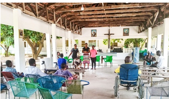
Interns meeting St Clare's residents