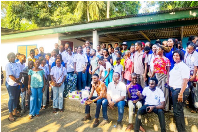
Mental Health Students Visit

This list has recently been reviewed and approved by the Board of Directors. It is currently available in GHS, Euro, and GBP; the GBP version is attached below as an example. Please contact us if you would like a copy in GHS or Euro.